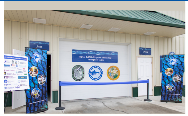
New facility front entrance.

• Develop new technologies for smartphone apps to engage citizen science information collaborations and commercial fisherman reporting of red tide toxin concentrations.