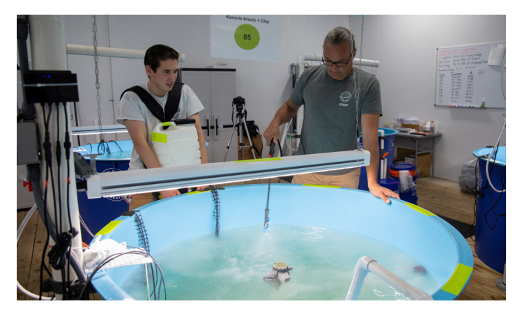
Clay application study in mesocosm lab