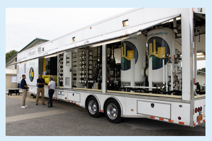
Ozonix project by Prescott Clean Water.