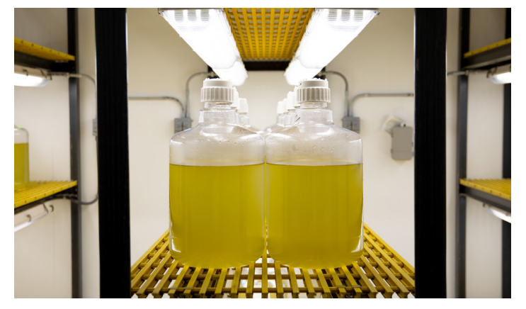
Red tide growing in culture room