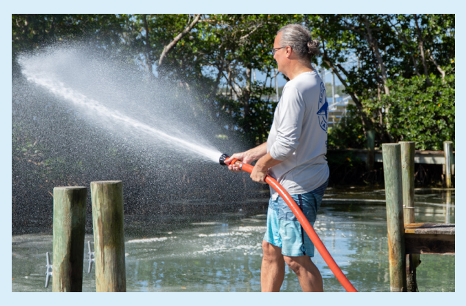
Testing the ability of clay dispersal to remove cells and toxins.

technologies have already started tier 3 testing. Projects in tier 2 testing at the Red Tide Mitigation and Technology Development Facility focus on integrating mitigation techniques while monitoring natural ecosystem components — including impacts on water quality and keystone animals such as blue crabs, sea urchins, clams, oysters, and shrimp.