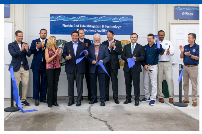
Governor DeSantis at the ribbon-cutting event for the new facility.